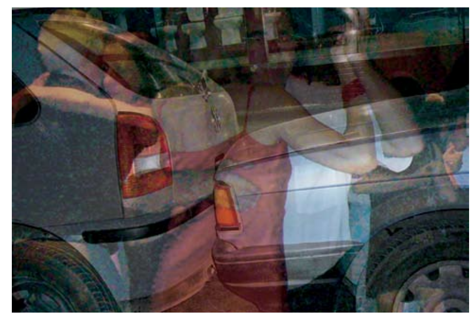
Bumping into other couples is a no-no at a milonga.