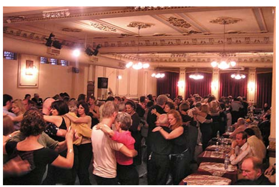
Club Español, one of the most traditional and beautiful porteño buildings.