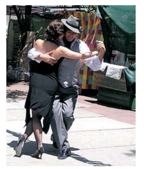
Street dancers at Plaza Dorrego